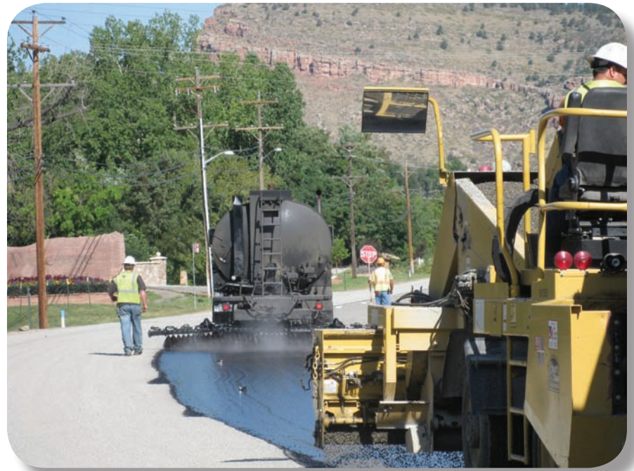
The Etnyre ChipSpreader follows immediately after the asphalt distributor, broadcasting 3/8-inch aggregate at the rate of 26 pounds per square yard.