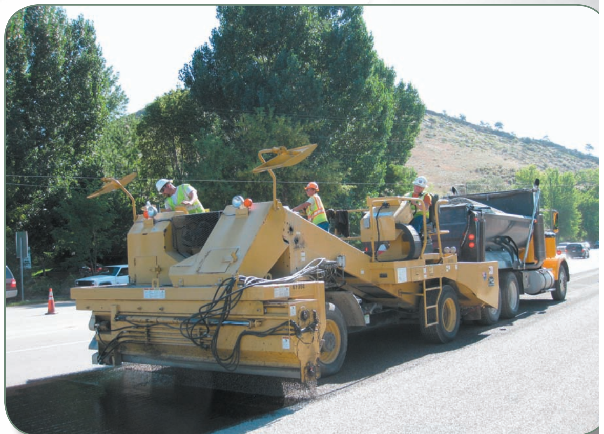
Contractor United Companies broadcasts aggregate during the chip sealing of 19 miles of US 36 between Estes Park and Lyons for the Colorado Department of Transportation.

Chip seal is one of a number of thin, non-structural maintenance applications that fall under the mantle of "pavement preservation." A growing awareness of these techniques, which protect and extend the service life of engineered road pavements, has led to their increased use by state DOTs and municipal agencies across the country. This awareness is being furthered by educational efforts of the Federal Highway Administration (FHWA); the American Association of State Highway and Transportation Officials (AASHTO); National